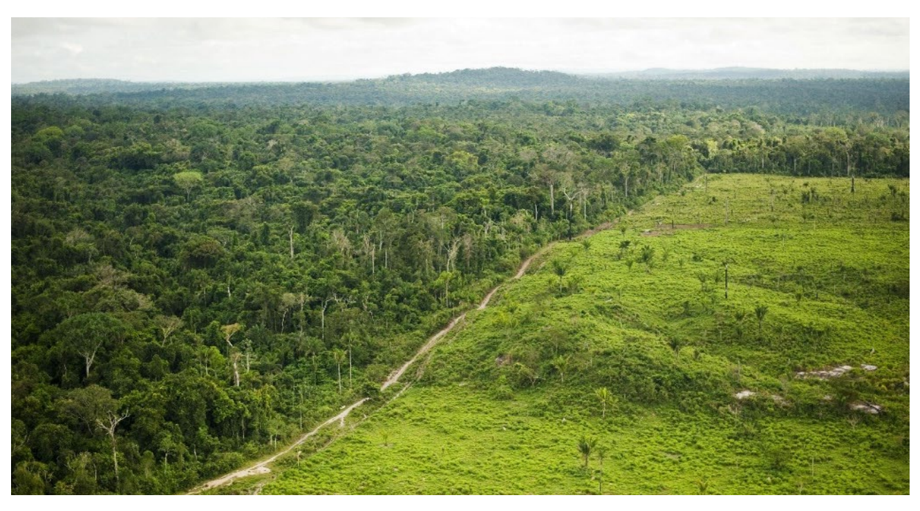
Deforestation in the Amazon for cattle ranching.