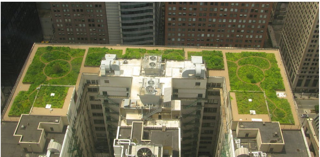
Green roof of Chicago City Hall