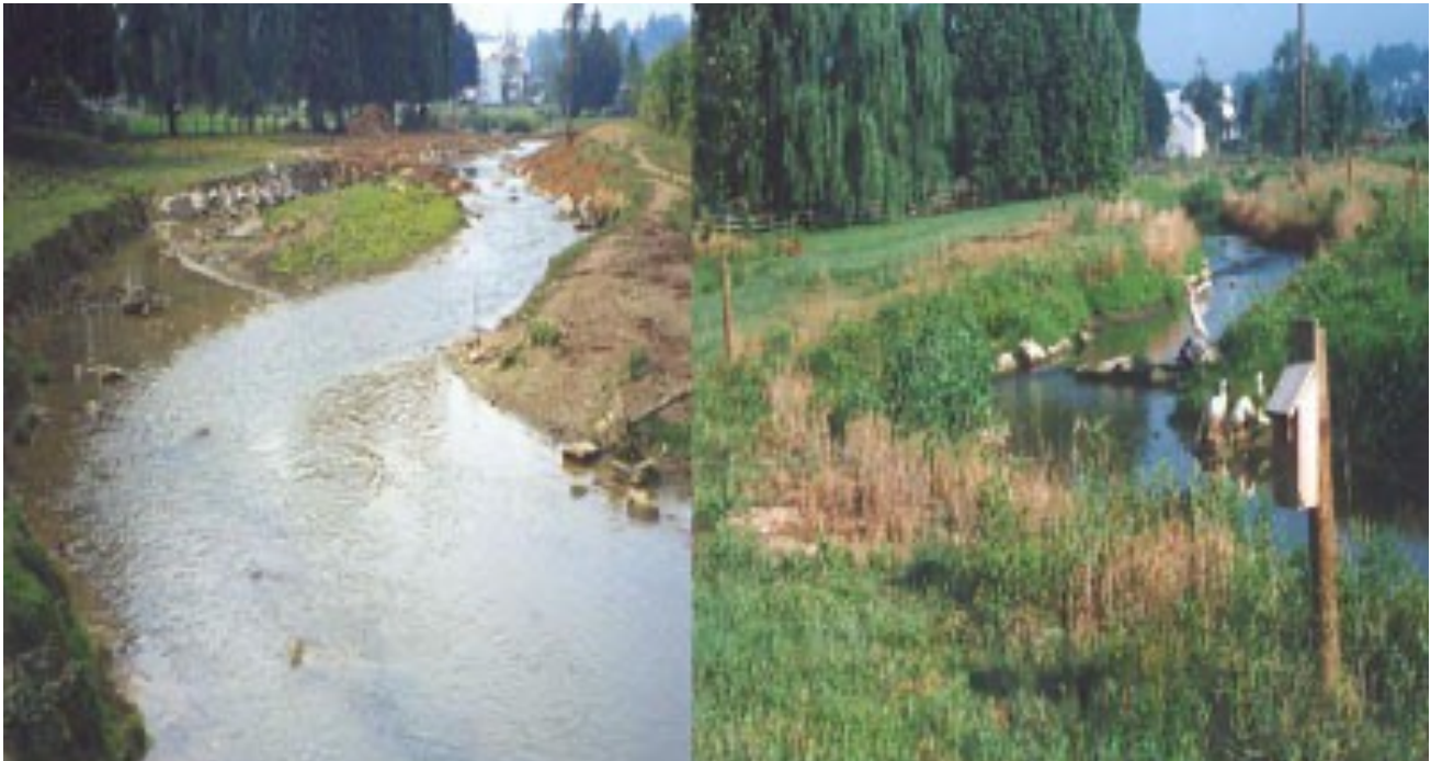
Riparian restoration in Pennsylvania—before and after