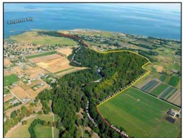
Lower Dungeness River floodplain Restoration, before and after